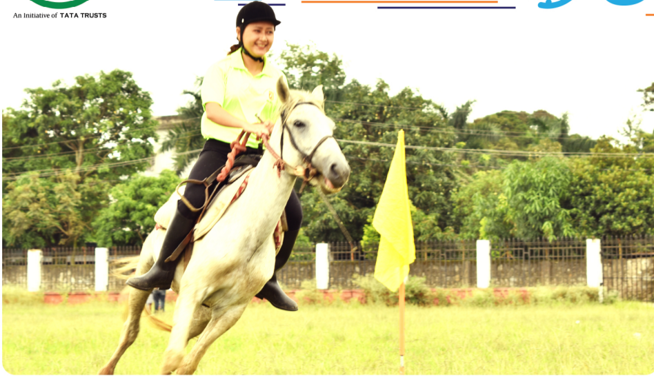
Trials for the grassroots development of women's polo programme at the Khuman Lampak Stadium, Imphal