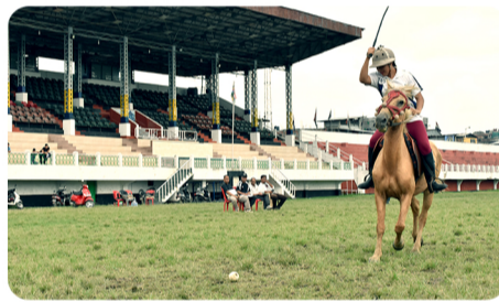
25 women between 15 and 30 were present at the Khuman Lampak Stadium for polo trials

were shortlisted. Of these twenty-five women, there will be a final selection of twenty-one athletes who will be trained under the guidance of veteran polo player Maisnam Khelendro and four master trainers.